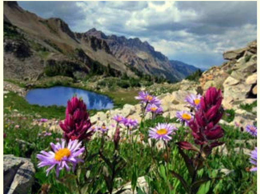
Jake Welsh ▲