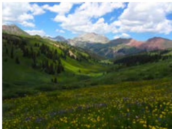
Hike to Aspen