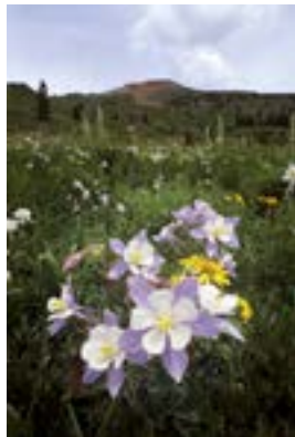
Dusty Demerson $110

Learn how to create stunning compositions using fore-, middle-, and background concepts in larger landscape photos. Camera placement, focus, aperture choice, and other techniques will be explained to help you create stronger and more compelling wildflower photographs. Must understand basic camera operations and how to use a tripod & lenses.