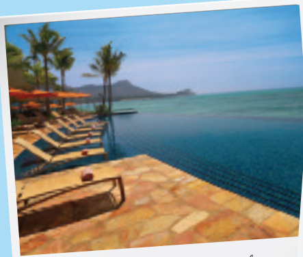
Sheraton Waikiki infinity pool