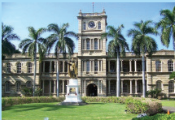
The Supreme Court of Hawaii