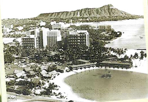
Waikiki Beach, 1963